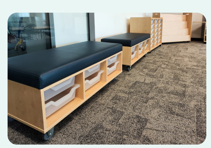
Seated Tote Trolleys provide extra seating and storage

Trinity College's love for flexible furniture, durable products, and end to end services has evolved into a long-term partnership with Furnware. As they continue to expand their locations and upgrade their current sites, Furnware continues to support them with their requirements.