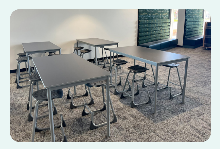
Our popular Rectangular Tables paired with Bodyfurn Lab Stools create high settings where students can collaborate or work individually.