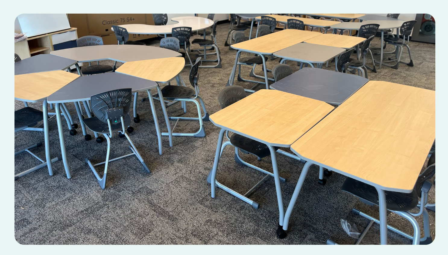
The Switch Table Range creates collaborative settings which can break away to become individual desking if required.